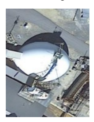
Ammonia Storage Tank